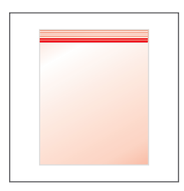
Tinted Plastic Bag