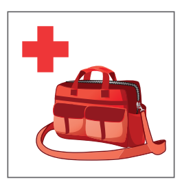
Medically Necessary and Diaper Bags*