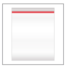
1-Gallon Plastic Freezer Bag