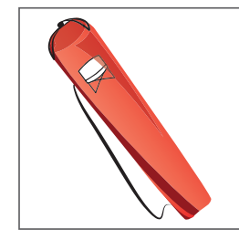
Folding Chair Bag (Folding Chair is Allowed)