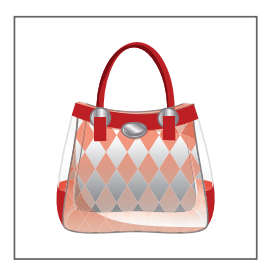
Printed Pattern Plastic Bag