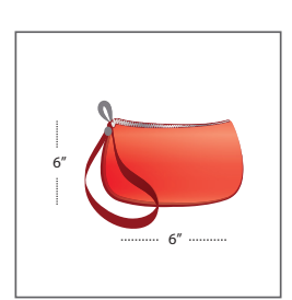
Bags smaller than 6"x 6"x 6"