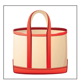
Over-sized Tote Bag